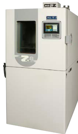
Temperature Cycling Chamber