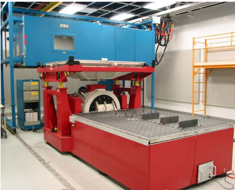
AGREE Temperature, Humidity Chamber interfaced with Vibration Shaker Table