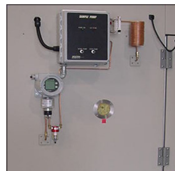
Gas Monitor System